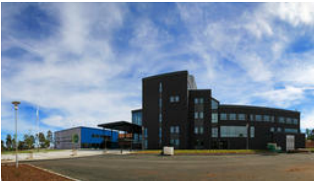
Figur 1: Campus Grimstad, Jon Lilletun veg 9